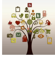
Website Changes coming soon